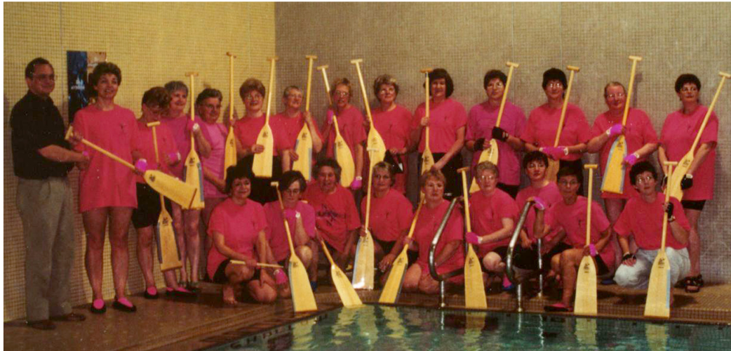
New paddles donated by Simplot