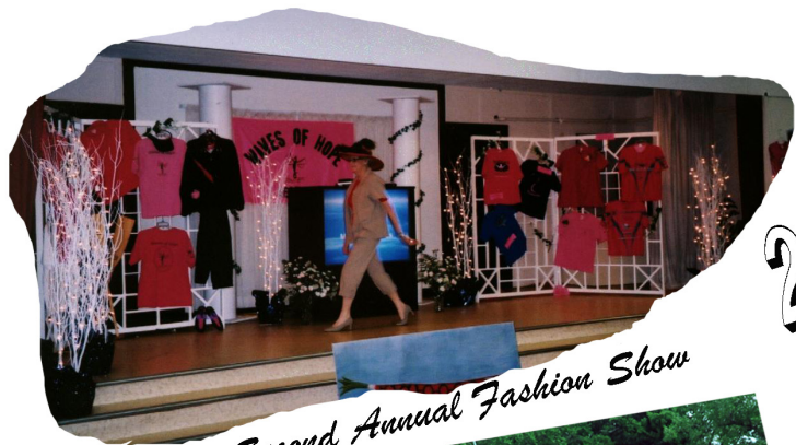
Second Annual Fashion Show