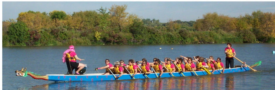
Wheat City Festival