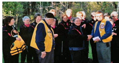
Rivers Lions Club donate Life Jackets