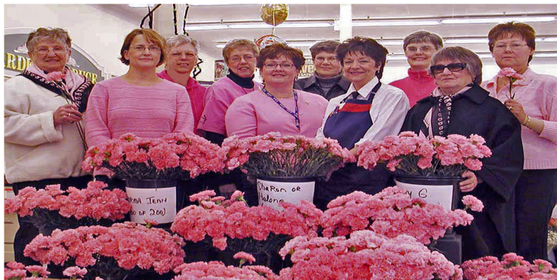
1st Link to Pink