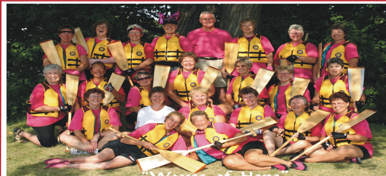
"Waves of Hope" Canadian Cancer Society "Manitoba Dragon Boat Festival"