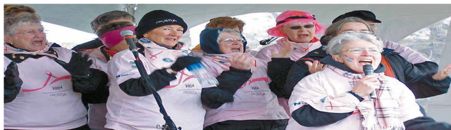
CRBC Run For The Cure