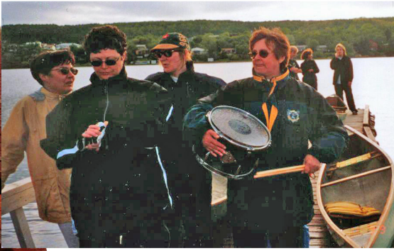
Practiced on the dock at Minnedosa and in two person canoes